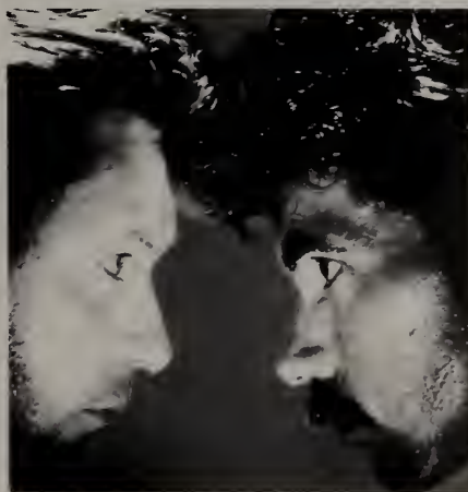
Daryl Hall & John Oates